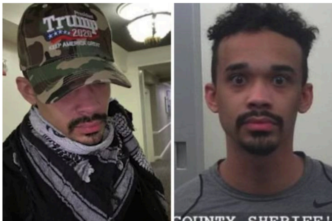
he looks warm with that scarf on ...the hat looks really nice..

One day he decided ..he said ..screw these antifa ..screw these BLM ..screw these FBI.. I just want to go and do my own thing.. I want to support Trump ..